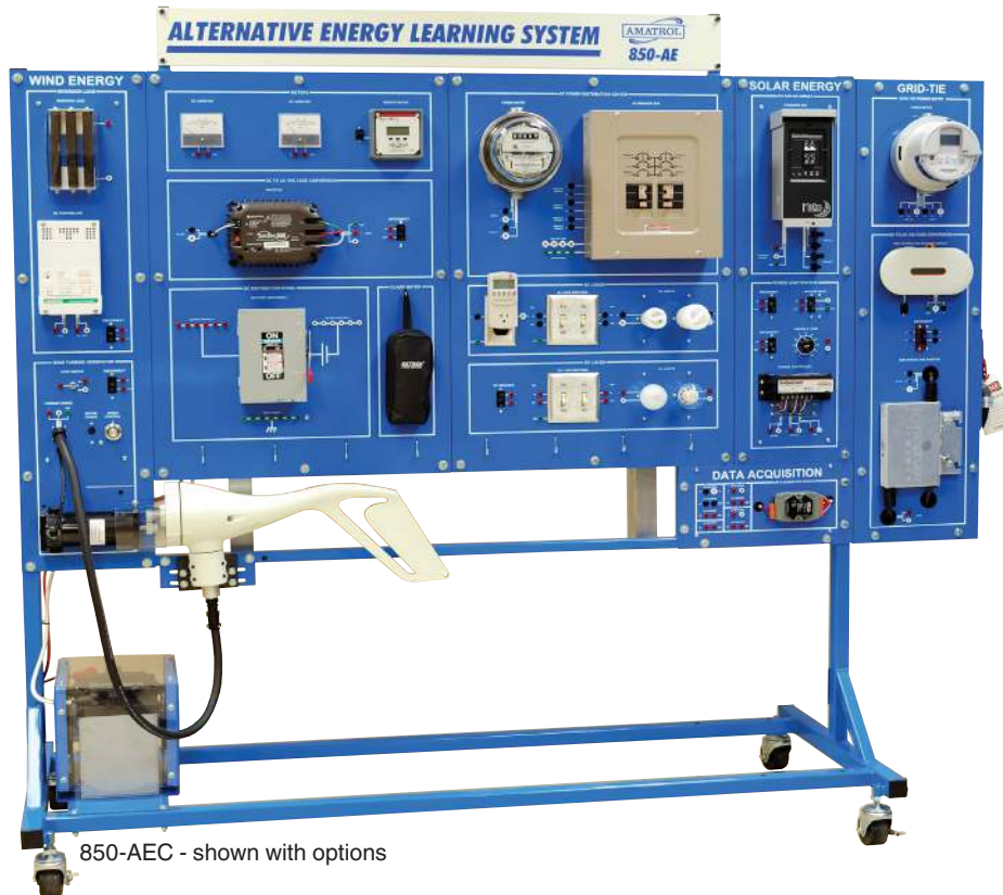
850-AEC - shown with options

The demand for qualified solar and small wind technicians is rising, as more consumers and businesses apply solar energy and small wind systems in their communities. Many employers prefer employment candidates who are certified. Amatrol's 850 series Alternative Energy Learning System supports the learning necessary to prepare for portions of the solar and small wind certifications offered by such certifying groups as NABCEP (North American Board of Certified Energy Practitioners), SWCC (Small Wind Certification Council), and ETA (Electronics Technicians Association).