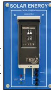
850-AEC Combiner Box