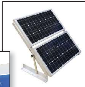
85-SPA1 - Solar PV Array Station