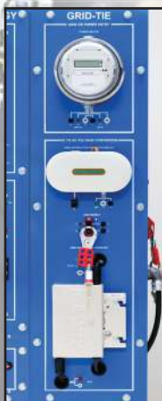
85-GT1 Grid-Tie Learning System

The 85-ADA1 Data Acquisition Learning System - Wind and Solar features a multi-point data acquisition module, PC software, and sensors that monitor voltage and current in various parts of both wind and solar circuits, enabling students to study operation via data analysis. Both options are panel-mounted units that easily add to the 850 workstation.