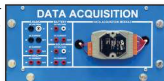
85-ADA1 Data Acquisition Learning System