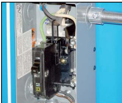
Breaker Connection to Power Rail

The 950-ELF1 not only teaches students proper installation of electrical wiring and components but also the importance of safe installation. Student curriculum emphasizes basic safety rules as well as the National Electrical Code (NEC) and other safety approval ratings. Students develop skills to identify and work with components that are marked with these safety ratings. Students also learn about and apply circuit protection and how to properly operate, install, and test circuit breakers.