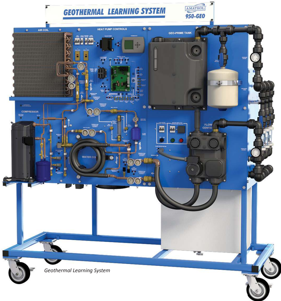
Geothermal Learning System