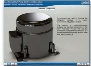
950-GEO1 Multimedia Curriculum

Amatrol's 950-GEO1 Geothermal Learning System includes feature-rich interactive multimedia curriculum that enables learners to move from an introduction about geothermal energy to overall system performance evaluation. Learners begin with an introduction to geothermal heat pump systems and move rapidly into the concepts and components that make a geothermal system operate; these include closed-loop circuits, compressors, condensers, evaporators, metering devices, refrigerants, suction line accumulators, receivers, dryers, moisture indicators, thermostats, controllers, blowers, heat-pump system start-up and operation, and overall system performance. Through partnerships with key industry leaders and leading edge educators in the area of geothermal energy, Amatrol has developed a system that puts learners on a solid path to obtaining the International Ground Source Heat Pump Association (IGSHPA) certification.