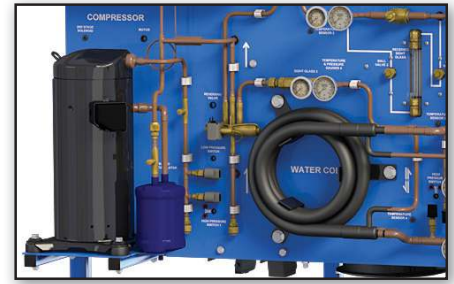
Industry Standard Components

From its 2-stage compressor and 2-ton heat pump to the ground source loop that includes a flow center and a header loop, Amatrol's 950-GEO1 delivers features commonly found in installed geothermal systems but often excluded from training systems. These include a variable speed ECM air blower, water coil heat exchanger, sight-glasses at many points in the system for observing the refrigerant cycle, ample temperature and pressure monitoring, electrical test points, ground simulation, and even the high-density polyethylene pipe specified for geothermal.