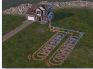
Simulates Ground Source/Sink

Amatrol's 950-GEO2's ground simulator is a temperature-controlled system that creates a constant temperature which allows the system to operate continuously. A digital, programmable temperature control unit is used to set and maintain the ground simulator at the desired temperature, resulting in both accurate data collection and continuous operation.