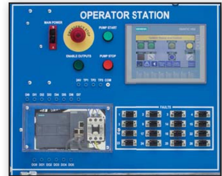
950-HTB1 Operator Station

The 950-HTB1 includes a large array of industrial-grade components on a mobile workstation, such as a Siemens S71200 PLC with HMI, a hydraulic power supply, supply and return lines, motor with flywheel, proximity switches, magnetic reed sensors, and a large selection of valves including relief, directional control, pressure reducing, check, cavitation, and air ingestion. Learners will use these components to practice hands-on troubleshooting skills that they can apply to real-world, on-the-job applications. Some of these skills include using an in-circuit test to troubleshoot a fixed-displacement pump, adjusting a cylinder cushion, troubleshooting a check valve, testing a hydraulic system by measuring fluid flow, and troubleshooting vibration in a hydraulic system.