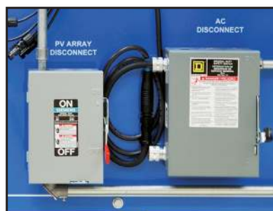
PV Array & AC Disconnects