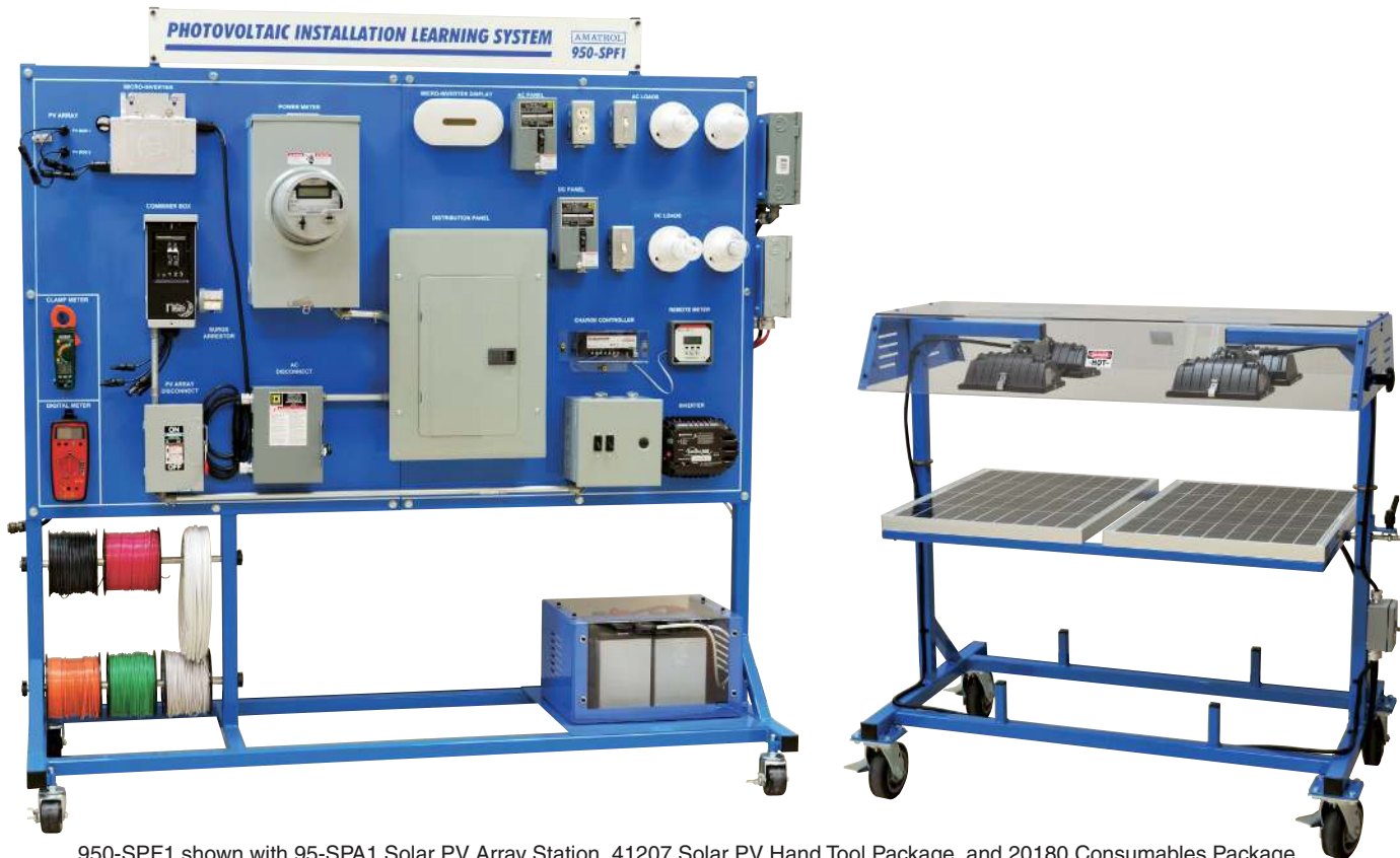
950-SPF1 shown with 95-SPA1 Solar PV Array Station, 41207 Solar PV Hand Tool Package, and 20180 Consumables Package