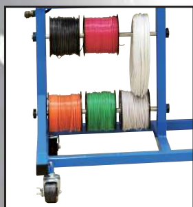
Wire Consumables Storage

This 950-SPF1 workstation has been designed to be an effective, self-contained, and durable learning device. Installation skills are performed quickly and all-inclusive at the workstation with the use of clamp-on meter, digital meter, wire consumables storage, and vertical component installation panel.