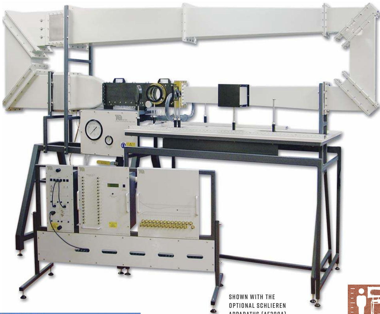
SHOWN WITH THE OPTIONAL SCHLIEREN APPARATUS (AF300A)

Investigates subsonic and supersonic air flow, including flow around two-dimensional models.