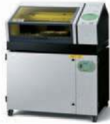
▲ Optional air filtration** system and stand