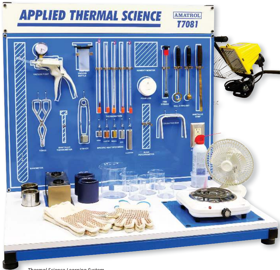
Thermal Science Learning System