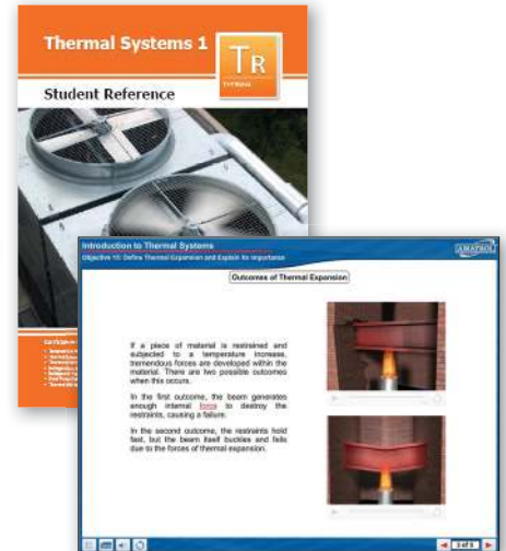
Optional Interactive Multimedia