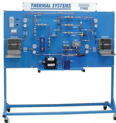
Amatrol's T7082: Air Conditioning / Heat Pump Learning System