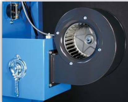
Industrial Blower with Damper (shown with blower guard removed)