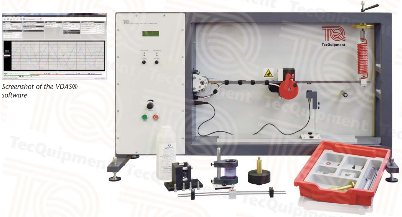
Screenshot of the VDAS ® software