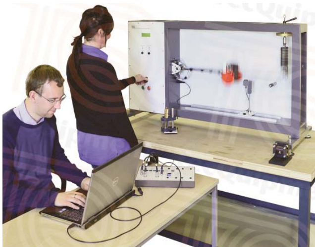
The TM1016 in use (other items not included)