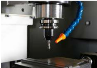
Table Mounted 6 or 8 Station Automatic Tool Changer (which can be removed to enable full 375mm X axis travel), Pneumatic Vice and Guard, Spray Mist Coolant, Automatic Lubrication System and 4th Axis Programmable Rotary Fixture (not available with flood coolant model).