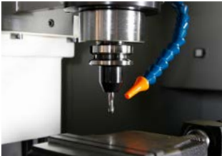
Table Mounted 6 or 8 Station Automatic Tool Changer (which can be removed to enable full 375mm X axis travel), Pneumatic Vice and Guard, Spray Mist Coolant, Automatic Lubrication System and 4th Axis Programmable Rotary Fixture (not available with flood coolant model).