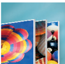
Rigid Outdoor Displays