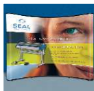
Rigid Outdoor Displays