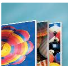
Flexible Indoor Displays