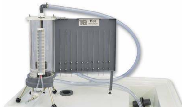
THE DIGITAL HYDRAULIC BENCH SHOWN WITH THE JET TRAJECTORY AND ORIFICE FLOW (H33) EXPERIMENT MODULE